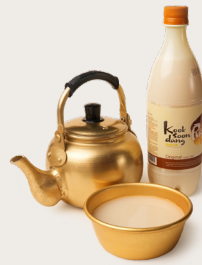
MAKGEOLLI (6% ABV) Korean rice wine