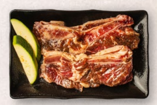
LA GALBI 14.5 Marinated short beef ribs with bones (220g)