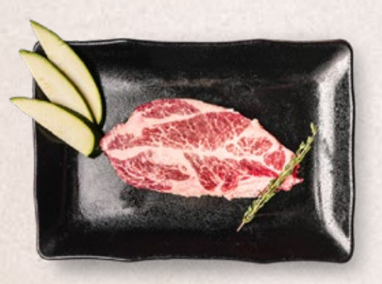
PORK COLLAR (GF) 15.5 Iberico pork neck (200g)