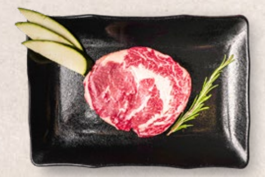
BEEF RIB EYE (GF) 18.5 Thick hand beef rib eye steak cut (200g) Angus beef UK