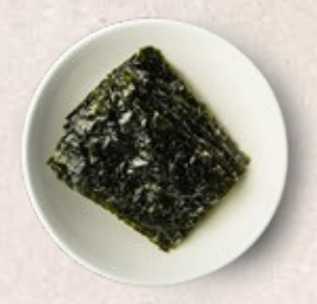
ROASTED SEAWEED (v) 2.0 MISO SOUP (v) 3.0