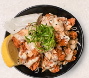
HONEY GARLIC & MAYO

KOREAN FRIED CHICKEN POPULAR 11.0 Korean fried chicken wings (5pcs) served with choice of;