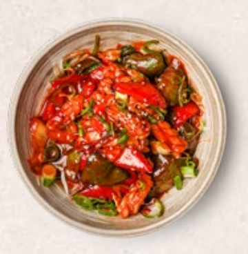
SPICY SQUID / 12.5 Stir-fried squid and vegetable in hot chilli sauce