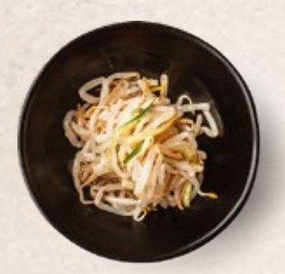
BEANSPROUT ( 3.0