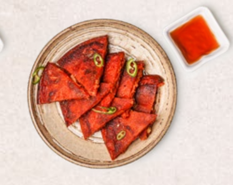
KIMCHI PANCAKE / 10.5 Traditional Korean pancake with Kimchi and spring onions