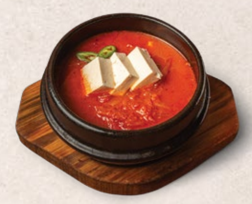
KIMCHI JJIGAE ✓ 13.0 Spicy Kimchi stew with pork and tofu, it comes with rice