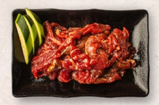
BULGOGI 13.5 Marinated thinly slices of beef (210g)