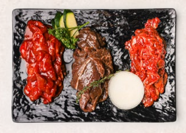
SPICY PLATTER 37.0 Assorted meat platter (total 630g) Spicy chicken, Bulgogi and spicy pork