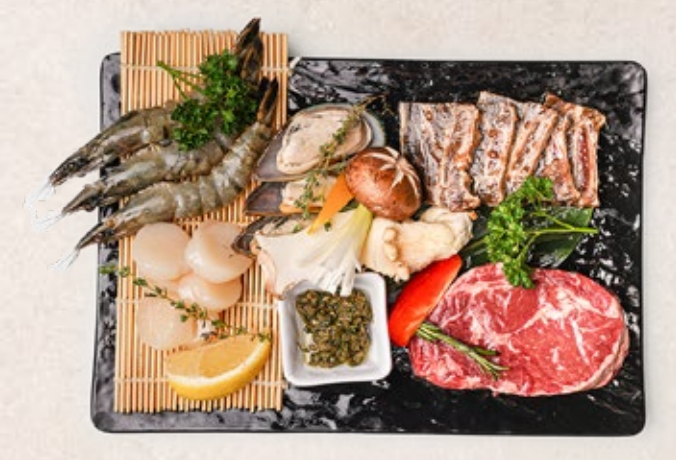
POPULAR PREMIUM PLATTER 49.5 Assorted seafood and meat platter Beef rib eye, LA galbi, tiger prawns (3pcs), scallops and mussels with Asian mushrooms and chimichurri sauce

Try our self-service table BBQ for an authentic Korean experience. We recommend ordering the spring onion salad (Pamuchim) and lettuce (Sangchu) to enjoy the best experience of Korean BBQ .