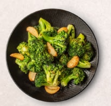
BROCCOLI W 8.0 Stir-fried broccoli seasoned served with garlic

Stem broccoli and goji berries with Japanese sesame dressing