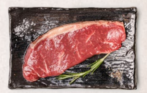
BEEF SIRLOIN (GF) 17.5 Thick hand beef sirloin steak cut (200g) Angus beef UK