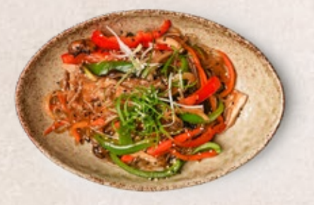
POPULAR JAP CHAE (V) 9.0 Stir-fried glass noodles and vegetables with soy sauce and sesame oil ADD BEEF + 1.5