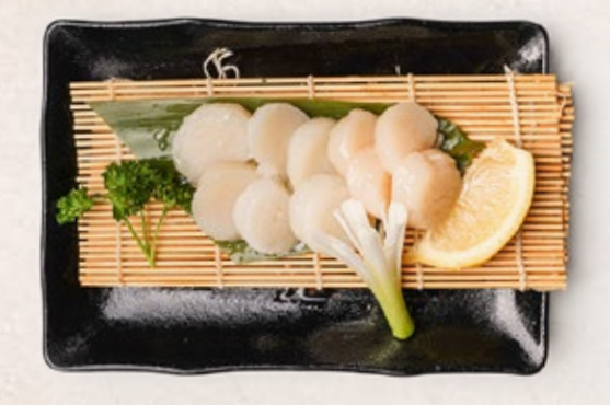
SCALLOP (GF) 17.0