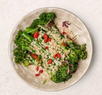
GOMA QUINOA TENDER STEM (%) 8.0

Stem broccoli and goji berries with Japanese sesame dressing