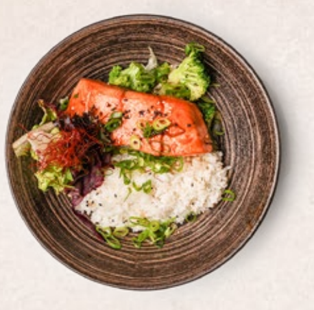
SALMON GUI WITH RICE 15.5 Salmon fillet and vegetables served with Korean sweet soy sauce

✓ Spicy (V) For Vegetarian (GF) Gluten Free