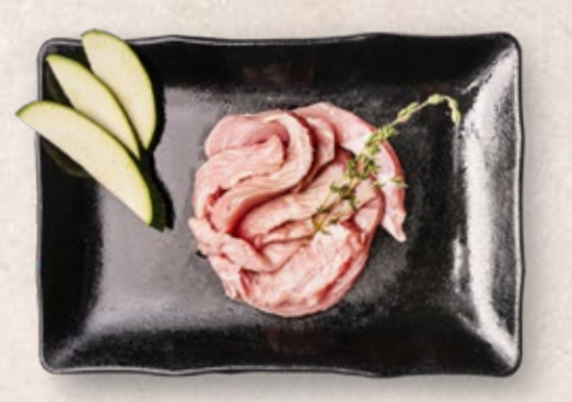
PORK JOWL (GF) 14.5 Cut of pork cheek (200g)