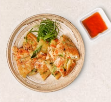
SEAFOOD PANCAKE 11.0 Traditional Korean pancake with mixed seafood and spring onions