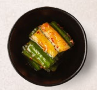
CUCUMBER KIMCHI 3.5