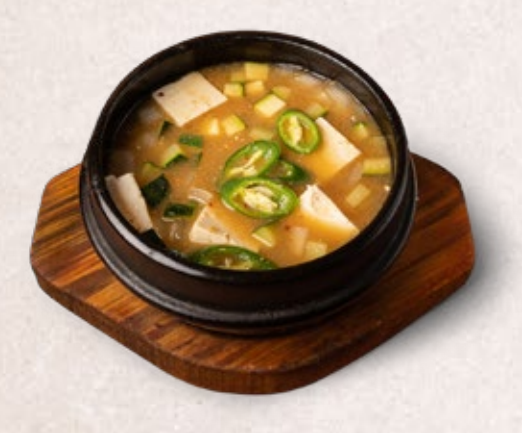
DOENJANG JJIGAE (*) 13.0 Soy bean stew with mixed mushrooms and tofu, it comes with rice