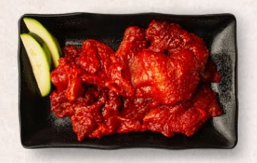
SPICY PORK ✓ 13.5 Marinated sliced pork with spicy sauce (210g)