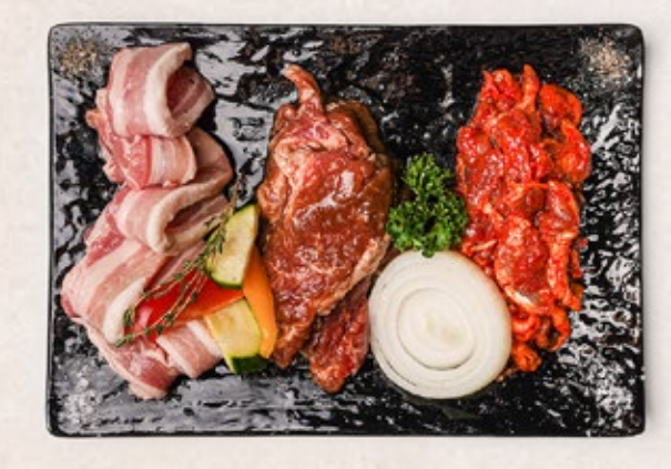
PORK DELUXE PLATTER 36.0 Assorted meat platter (620g) Pork belly, Mapo Galbi and spicy pork