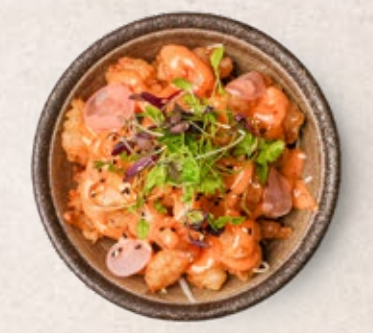
ROCK TEMPURA 11.5 Popcorn prawn with spicy mayo