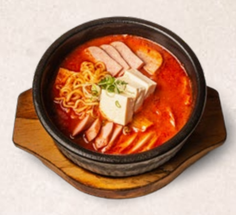
BUDAE JJIGAE 4 14.5 Spicy hot pot made with sausage, ham, pork, noodles and tofu, it comes with rice