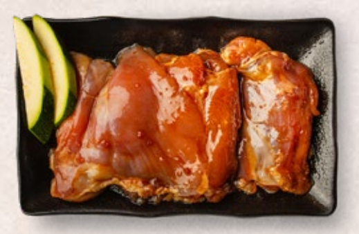
SOY CHICKEN 13.0 Marinated chicken with soy sauce (210g)