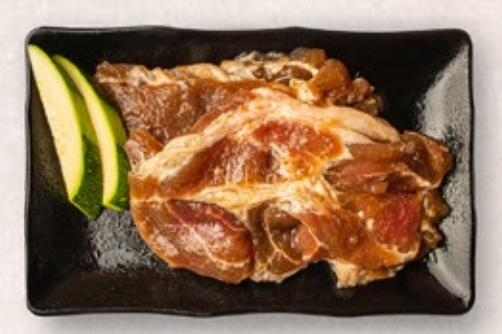
MAPO GALBI 13.0 Marinated pork neck (210g)