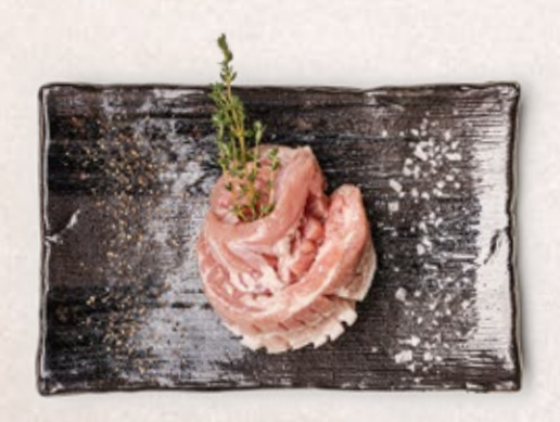
PORK BELLY SKIN ON (GF) 13.5 Thick hand pork belly cut (200g) Free range