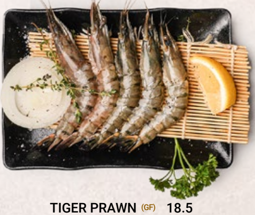
Tiger prawns (5pcs)