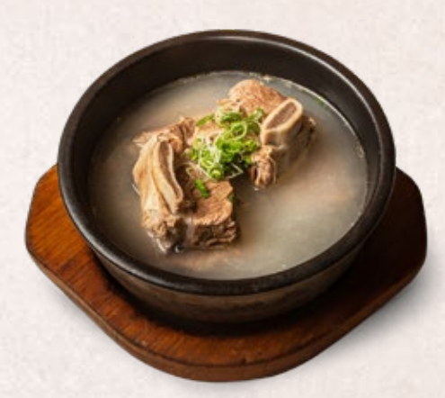
GALBITANG 14.5 Mild short beef rib soup with radish and glass noodles, it comes with rice