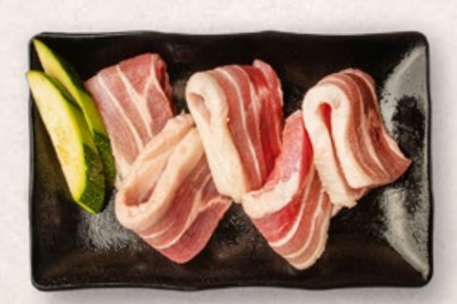
PORK BELLY (GF) 12.5 Sliced pork belly (200g)