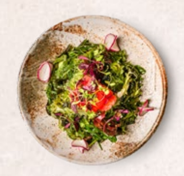
SEAWEED SALAD (V) 8.5 Seaweed salad with tosazu dressing