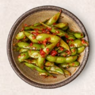
SPICY EDAMAME (V) 5.0 Pan-fried soy beans with homemade chilli sauce