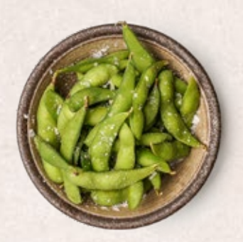
EDAMAME (V) 4.5 Soy beans sprinkled with salt