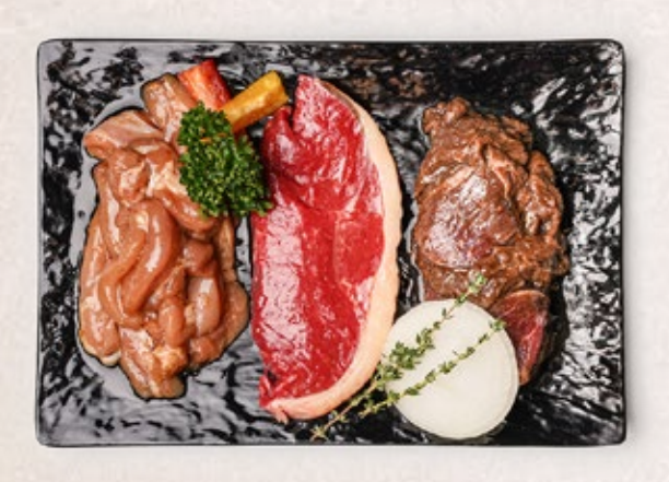
SPECIAL PLATTER 39.5 Assorted meat platter (total 620g) Beef sirloin, Bulgogi and soy chicken