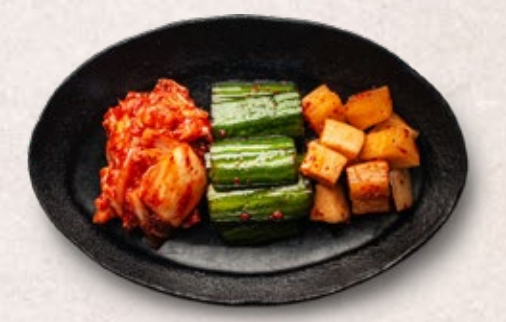
ASSORTED KIMCHI ≠ 8.5 A selection of spicy cabbage, radish and cucumber Kimchi