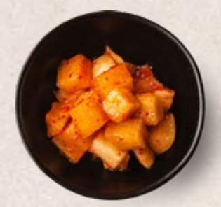
RADISH KIMCHI 🥒 3.5