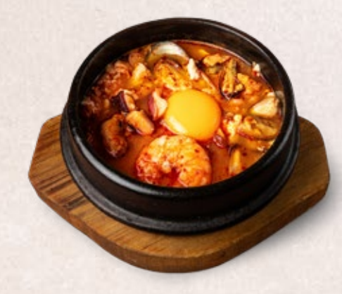
SOONDOOBU JJIGAE 13.5 Spicy soft tofu stew with mixed seafood topped with egg, it comes with rice